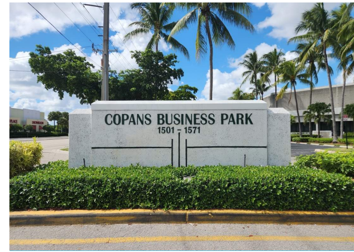
Detail Side B