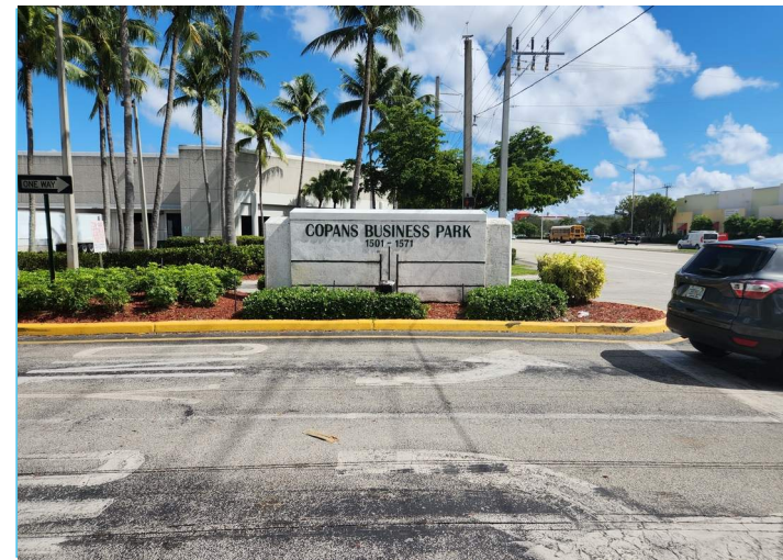
Detail Side A

Sign Type: Monument Material type: Concrete/Stone Qty: 1 Illumination: Flood Approx. Size: 5'-8" H x 15'-0" W